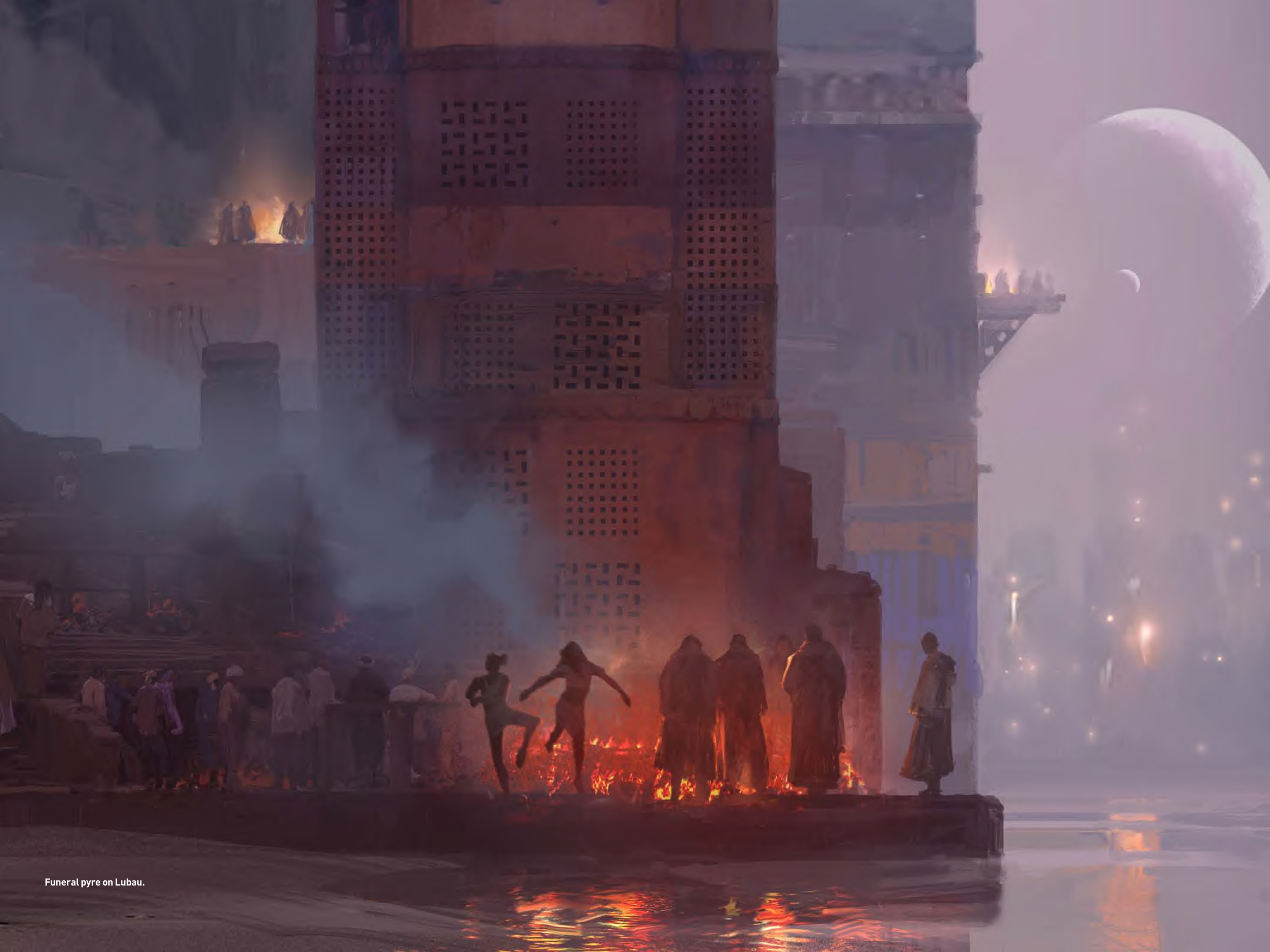
Funeral pyre on Lubau.