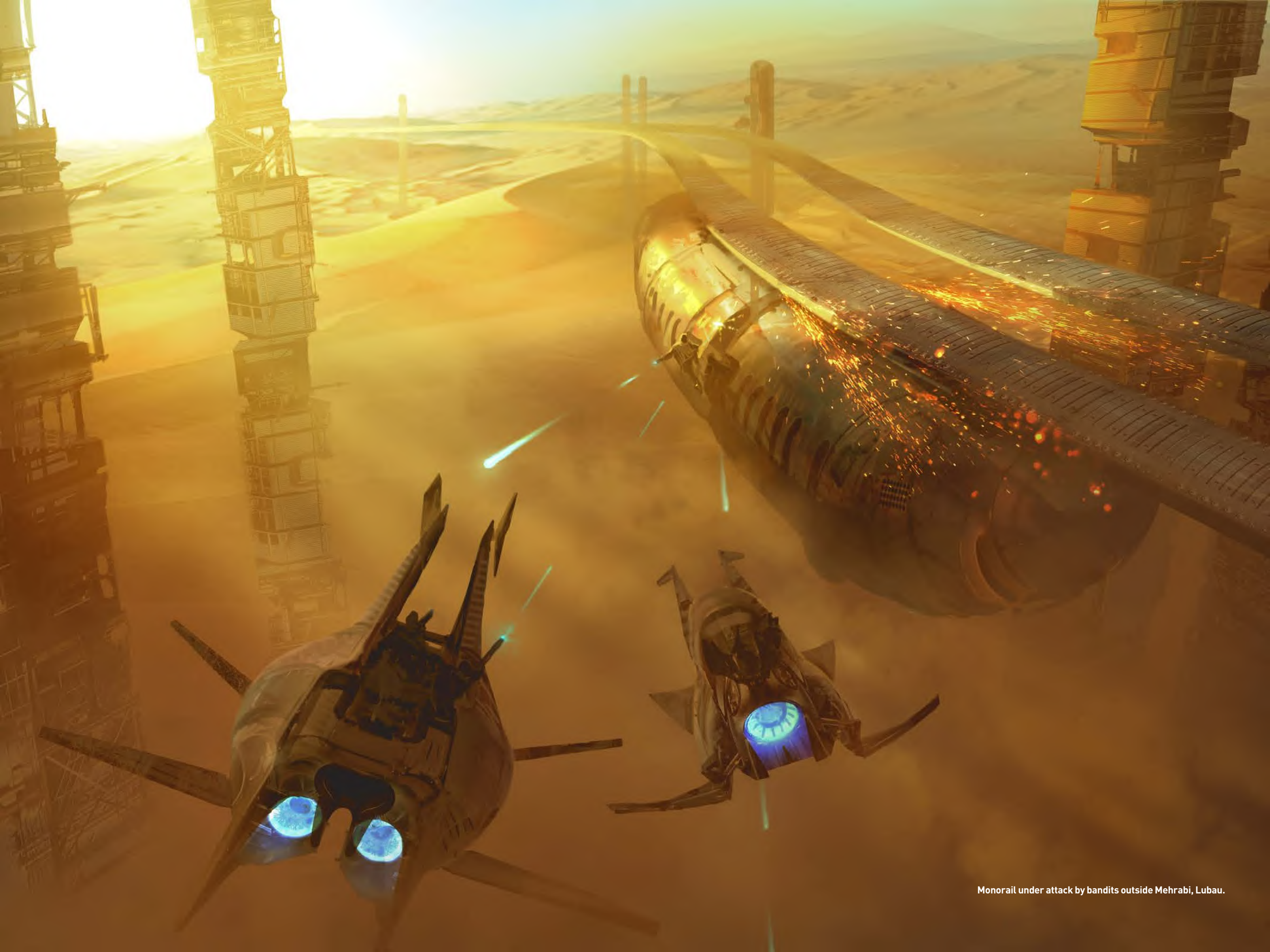
Monorail under attack by bandits outside Mehrabi, Lubau.