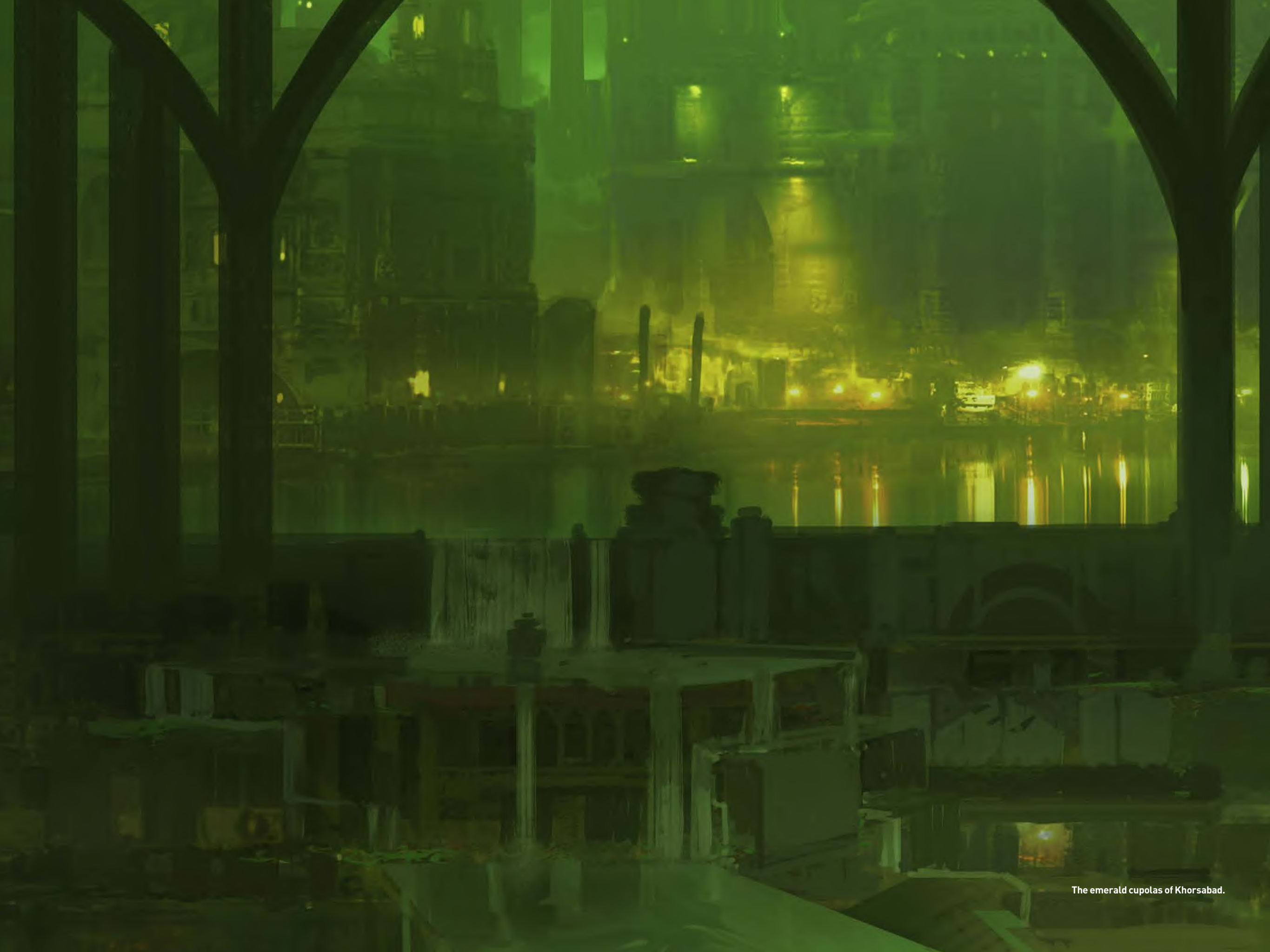
The emerald cupolas of Khorsabad.