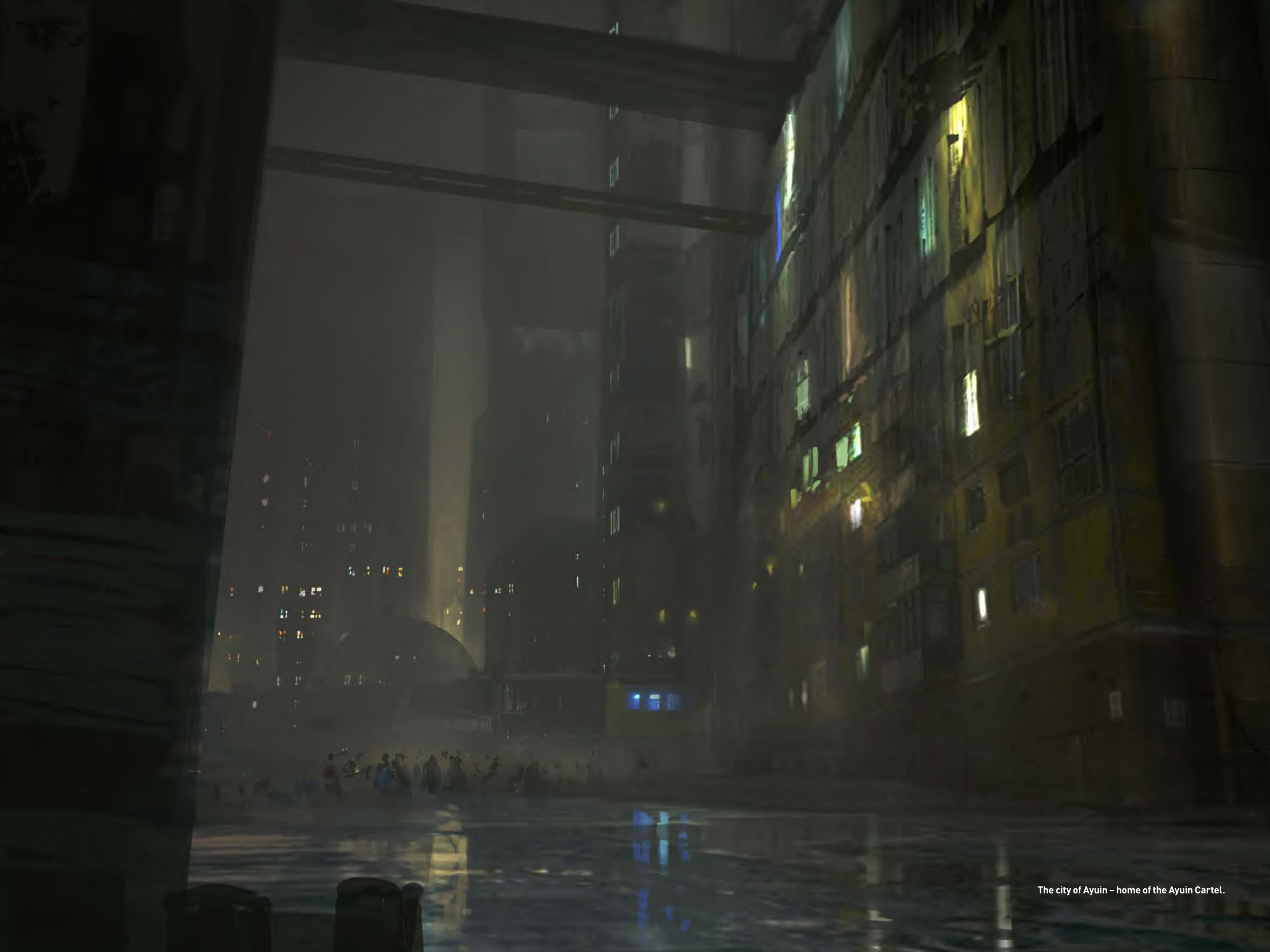
The city of Ayuin – home of the Ayuin Cartel.