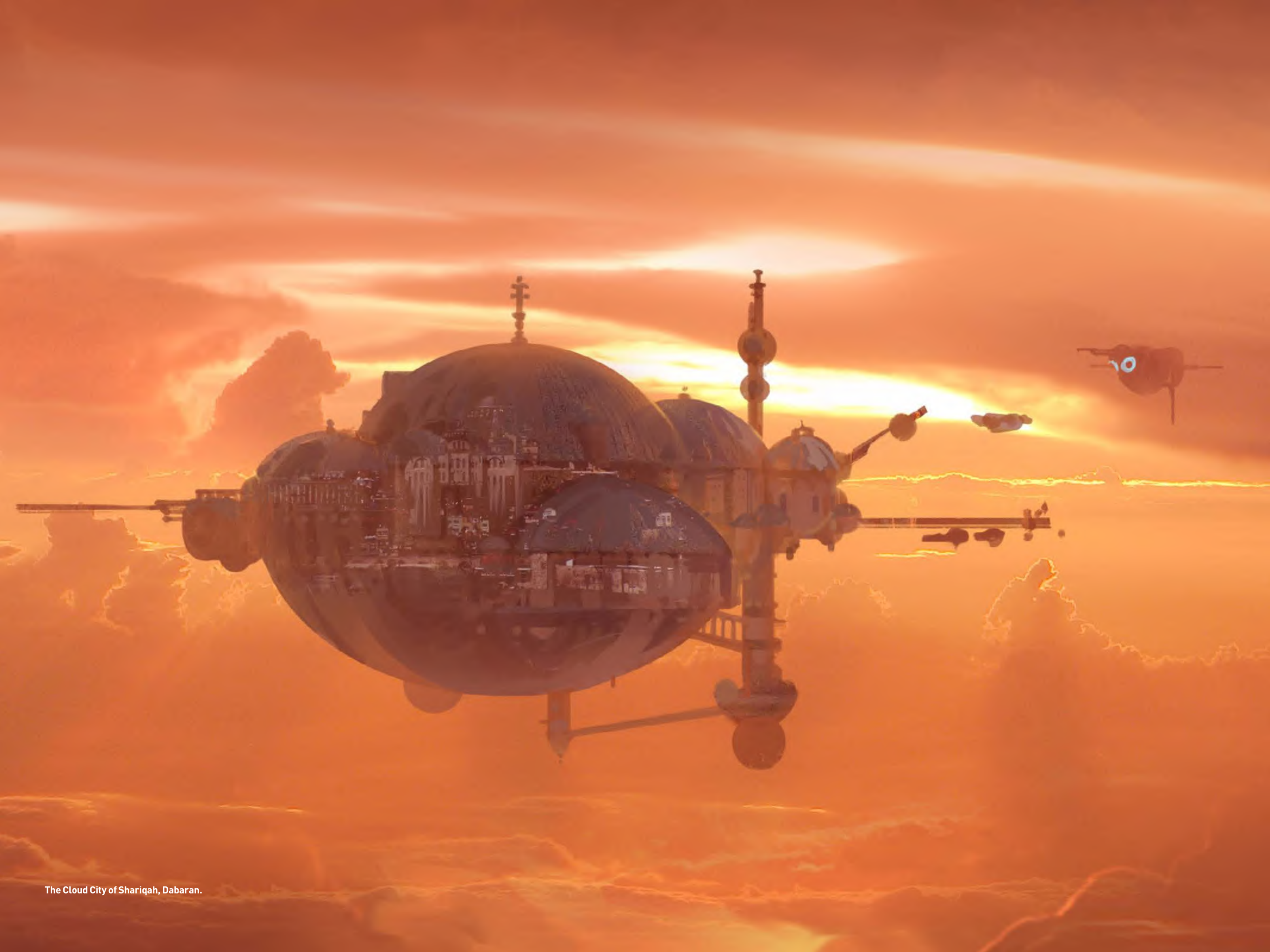
The Cloud City of Shariqah, Dabaran.