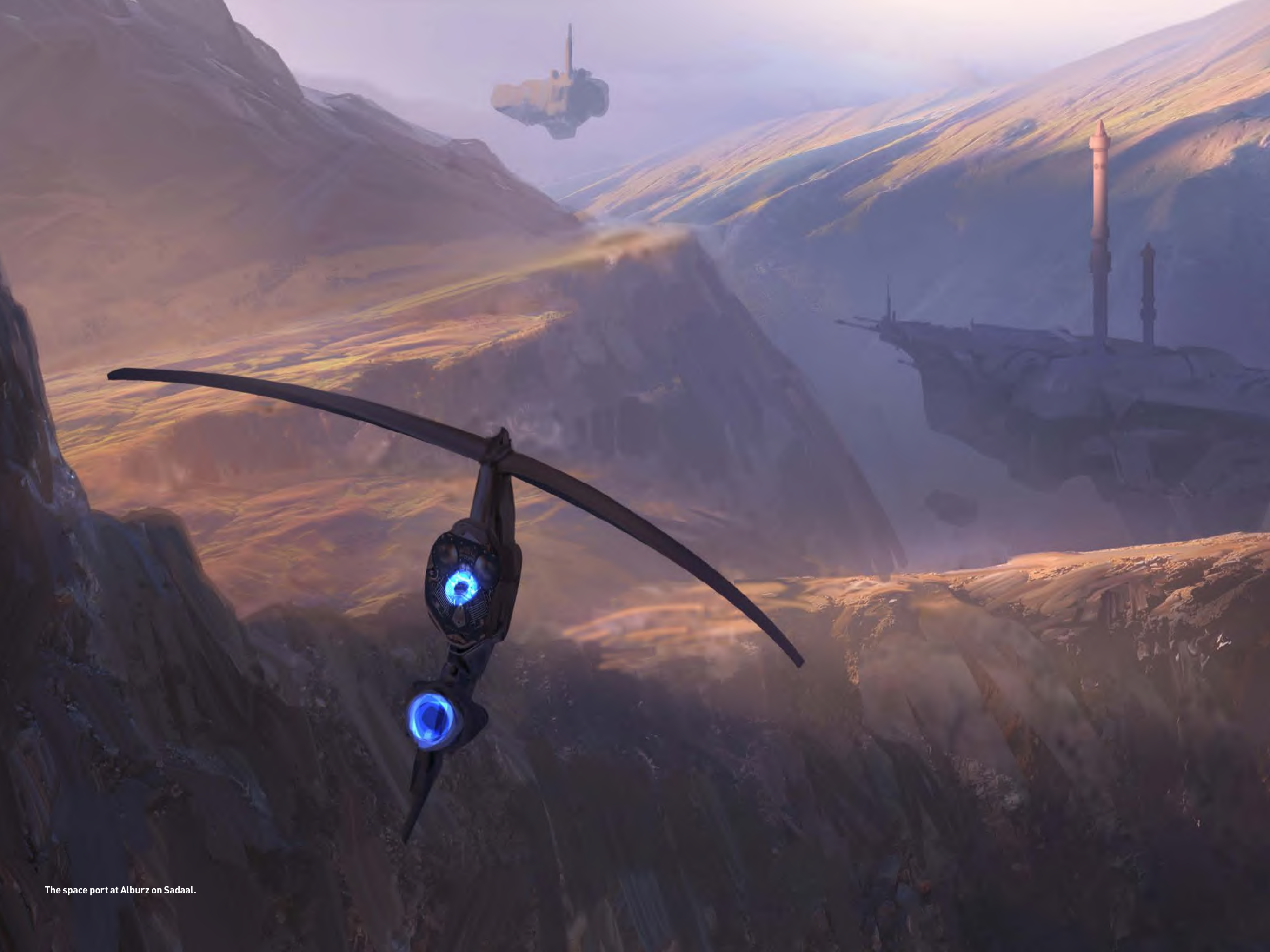
The space port at Alburz on Sadaal.