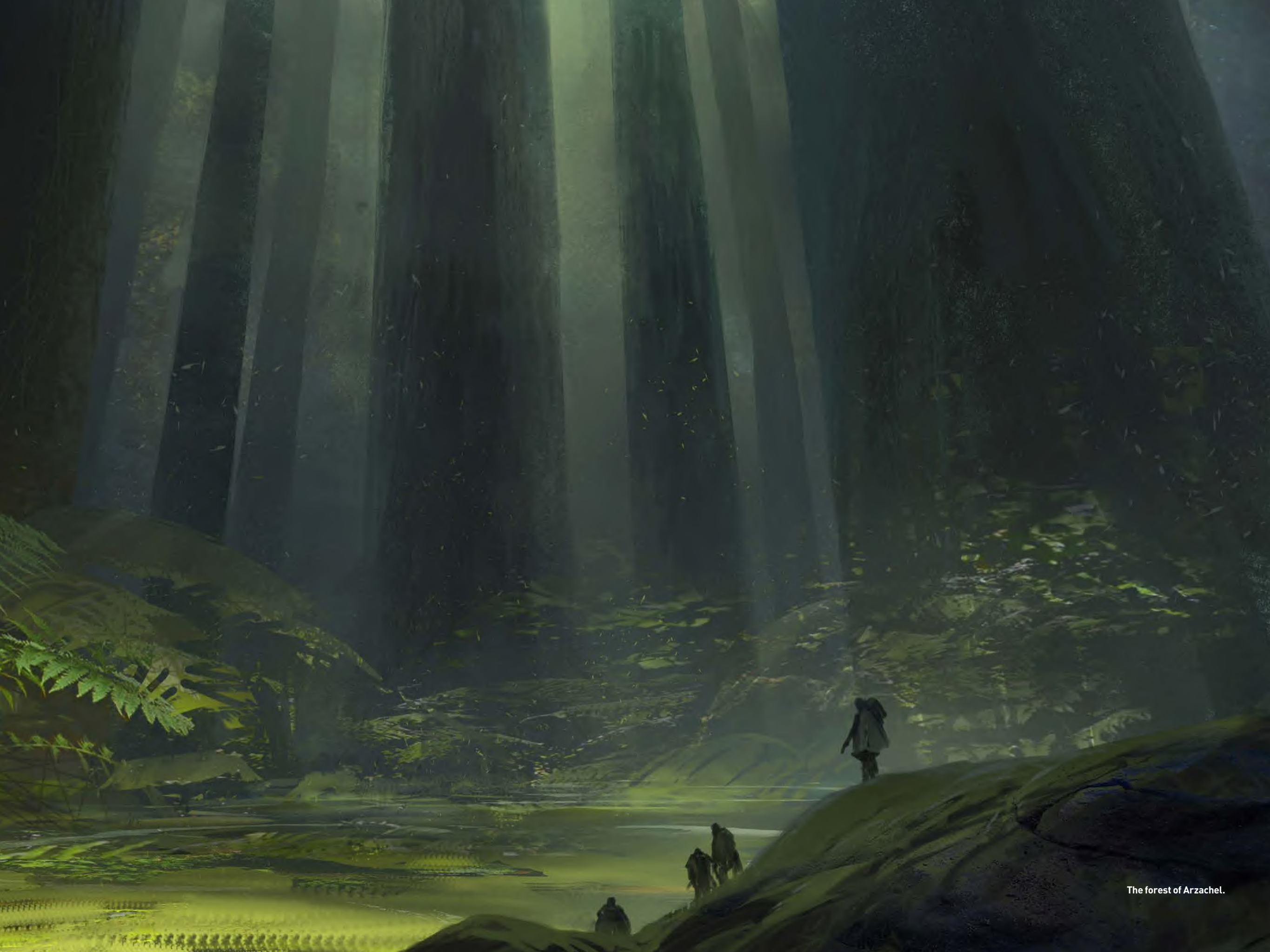
The forest of Arzachel.