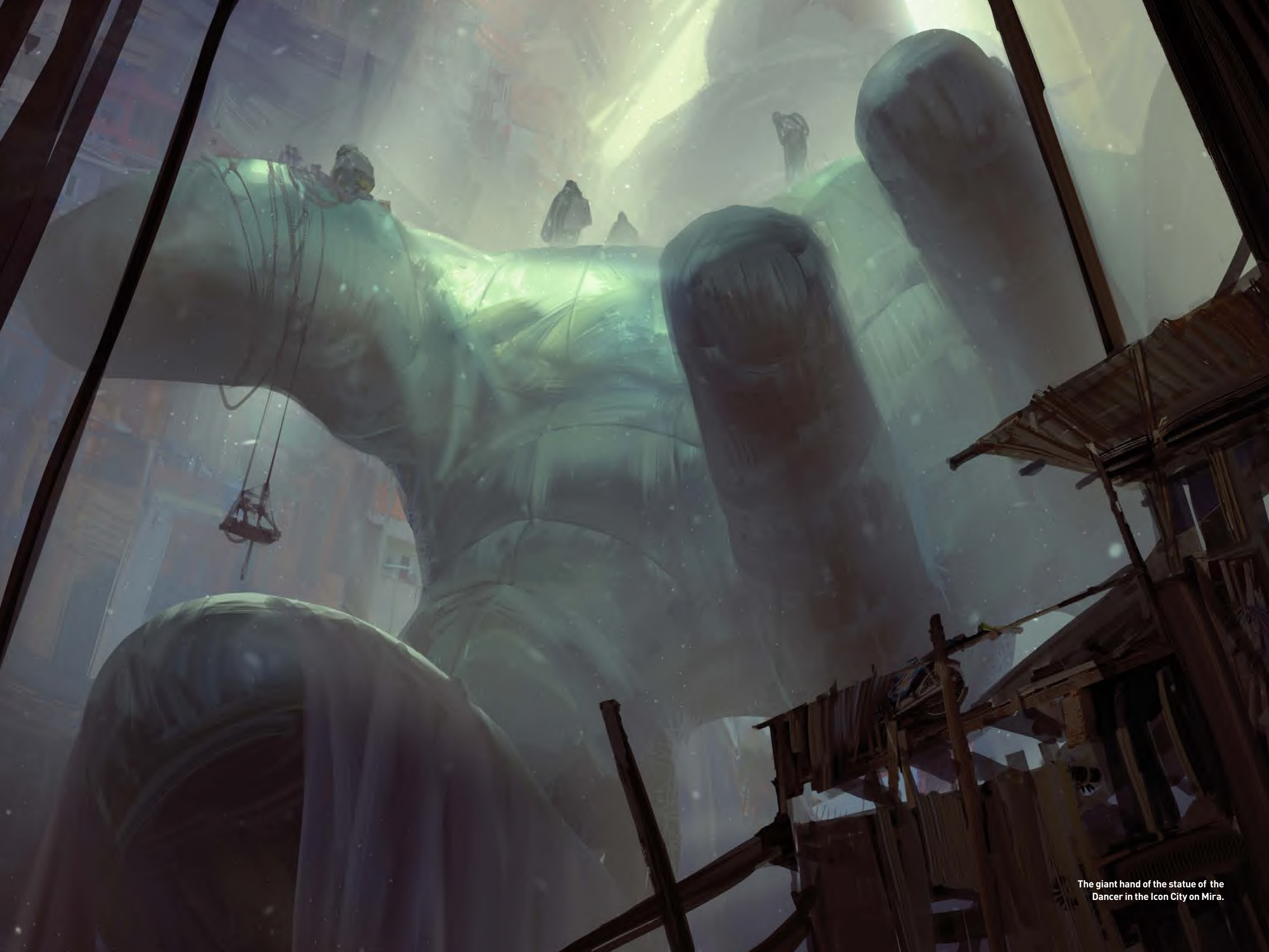
The giant hand of the statue of the Dancer in the Icon City on Mira.