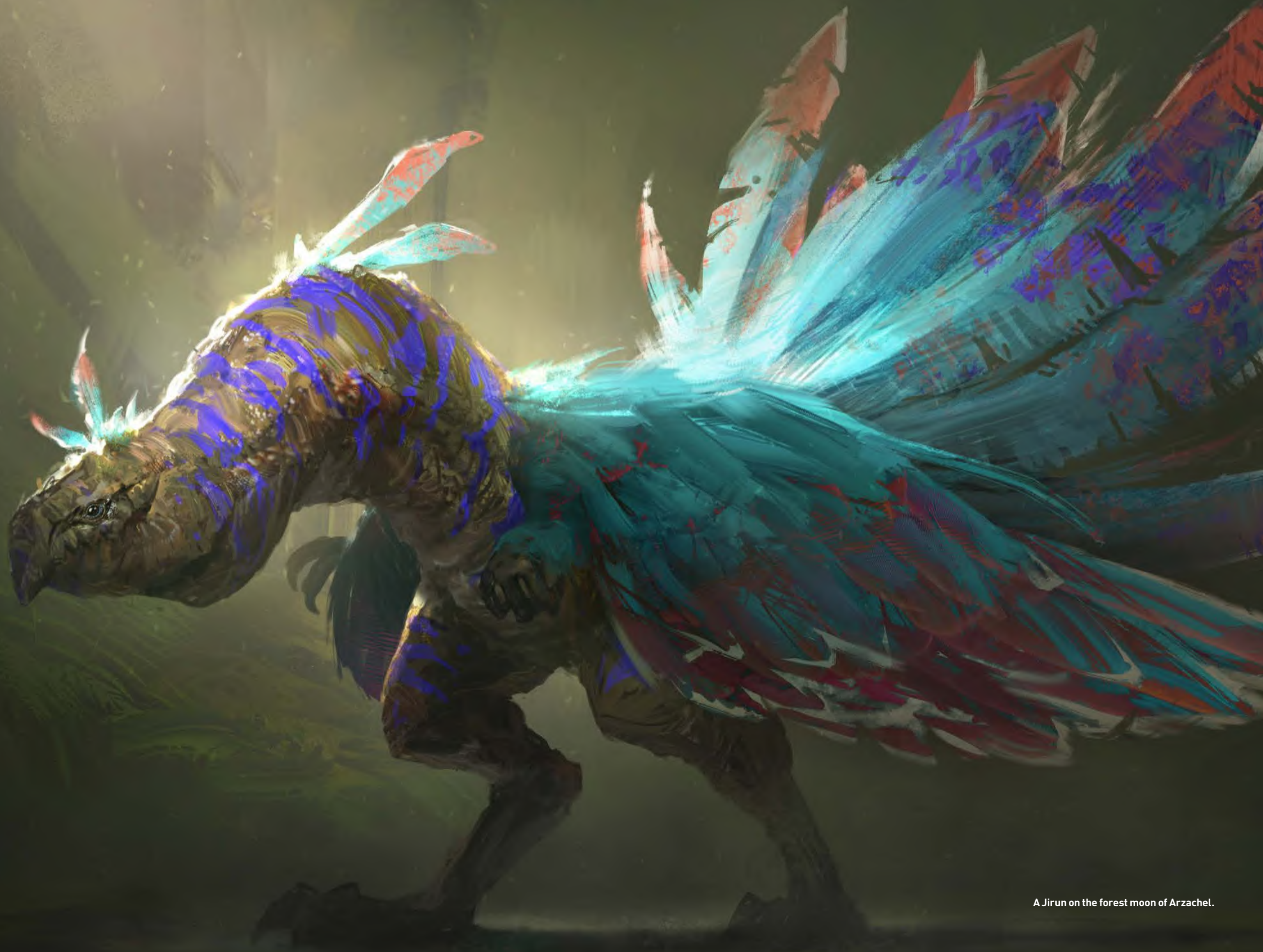
A Jirun on the forest moon of Arzachel.