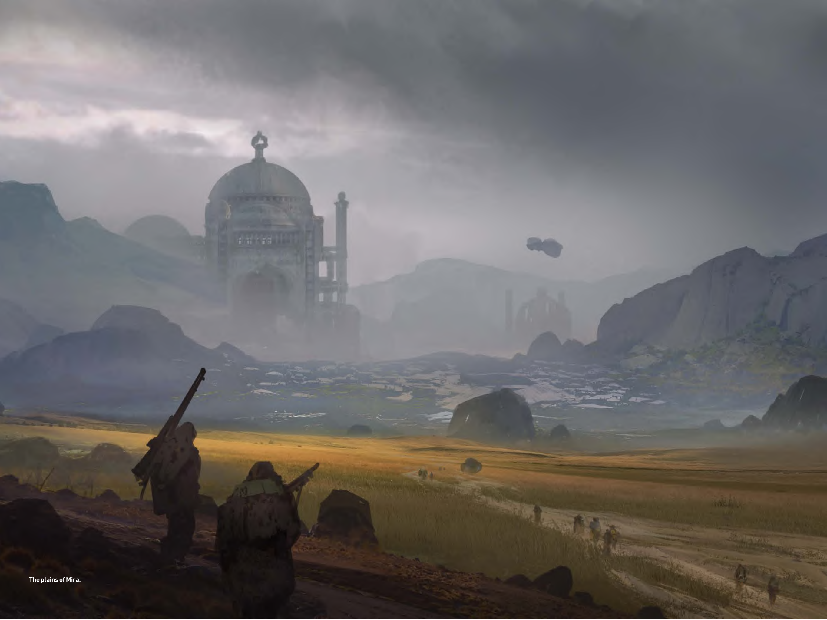
The plains of Mira.