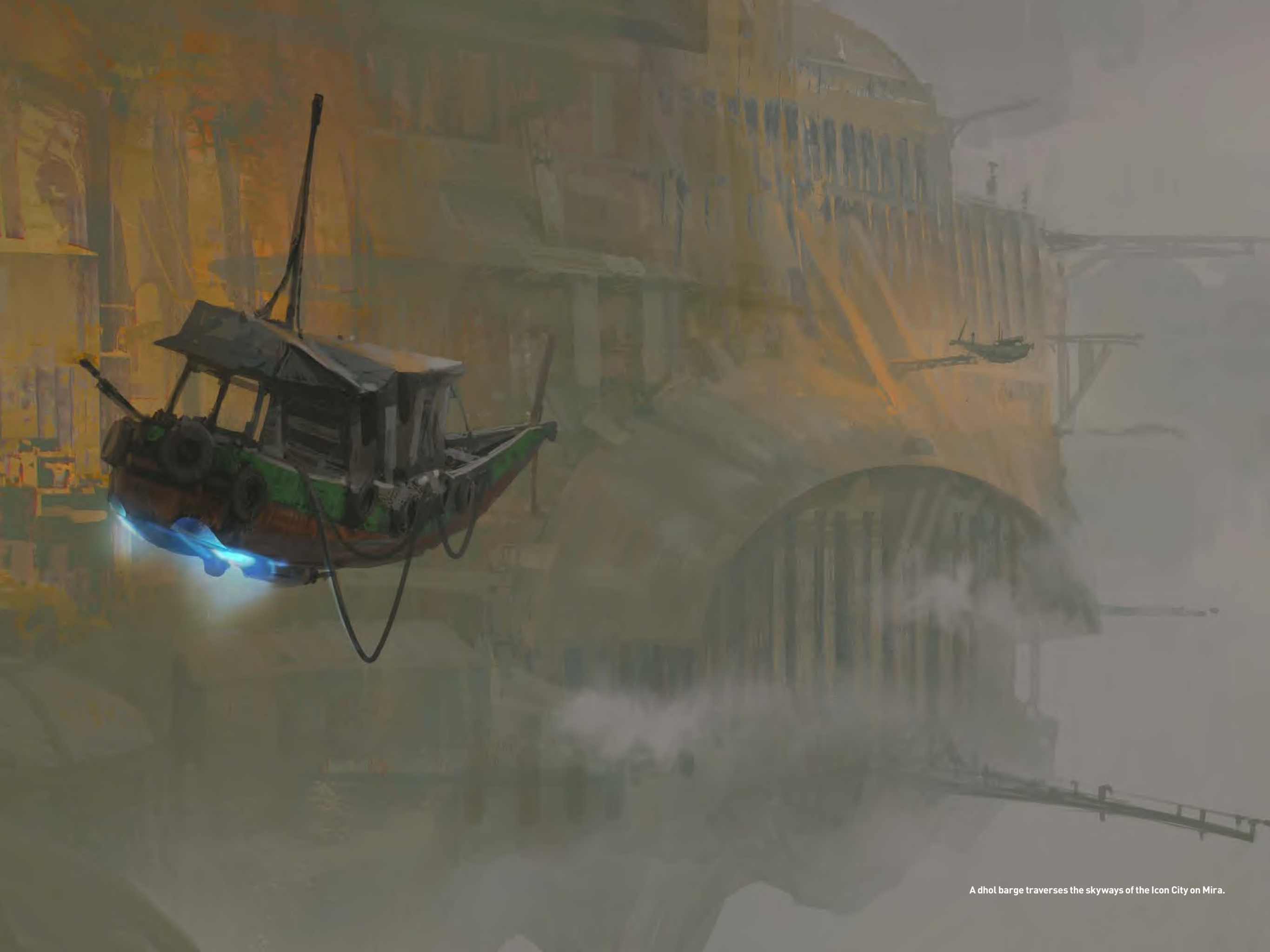
A dhol barge traverses the skyways of the Icon City on Mira.