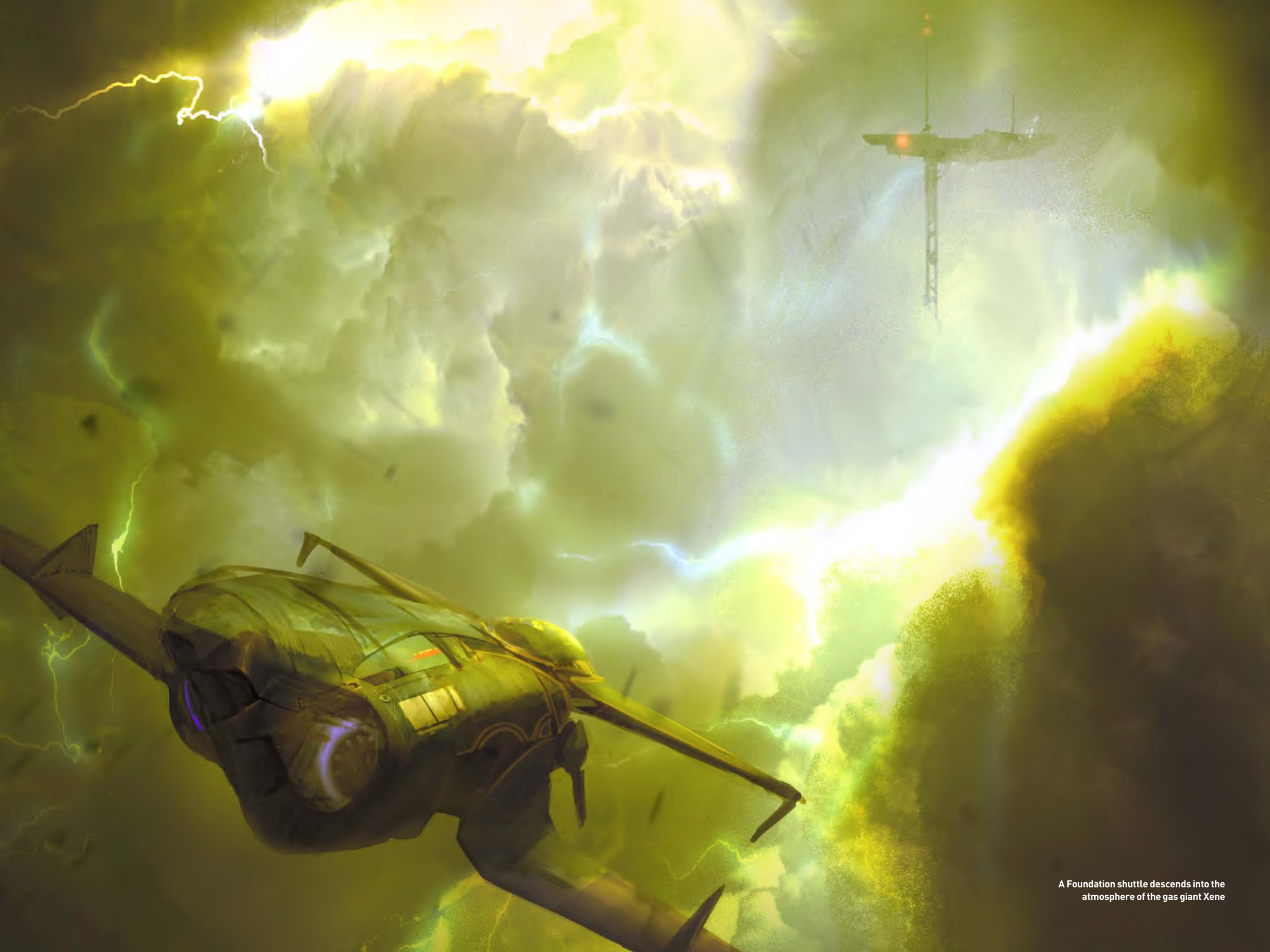
A Foundation shuttle descends into the atmosphere of the gas giant Xene