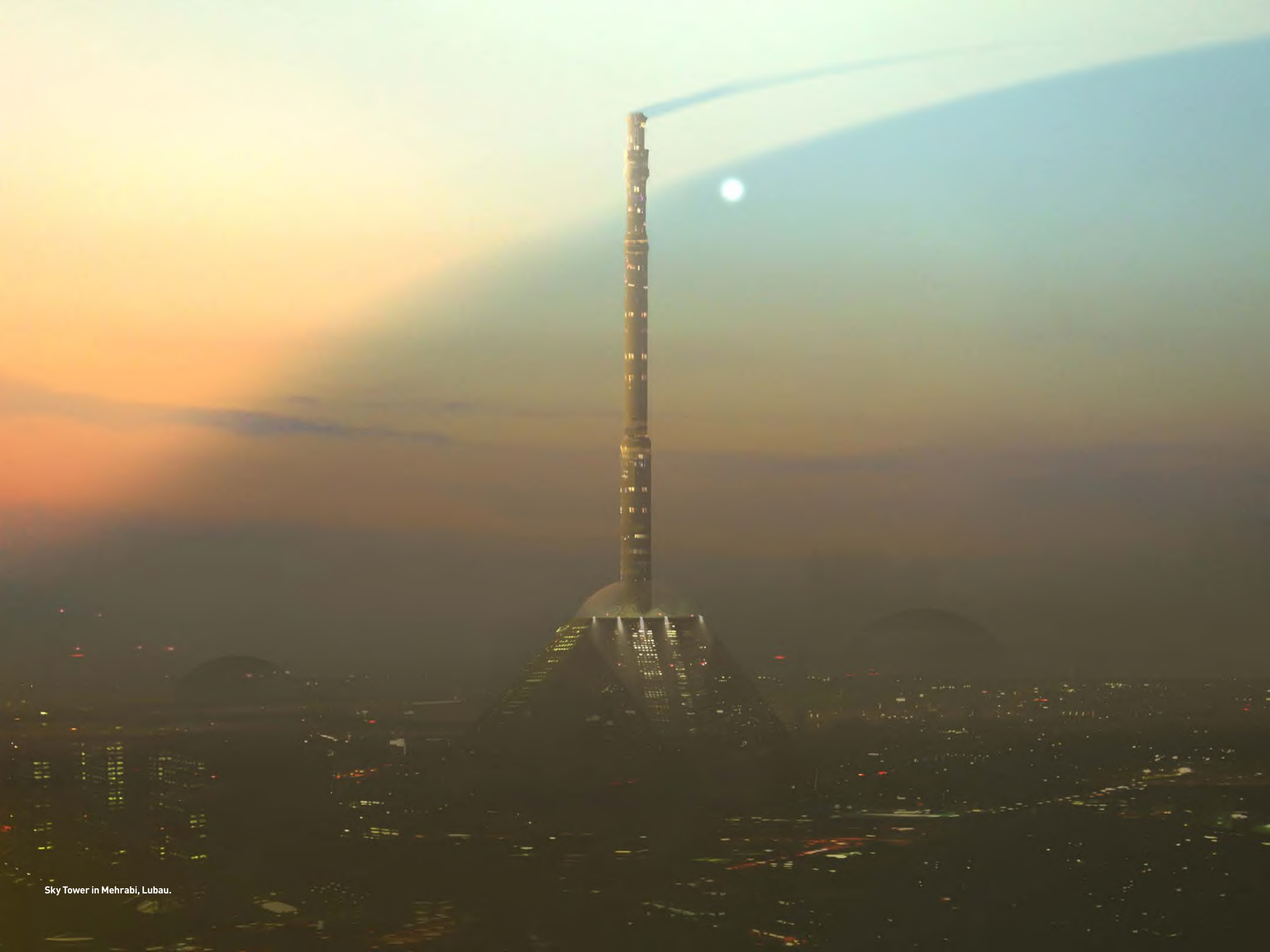
Sky Tower in Mehrabi, Lubau.