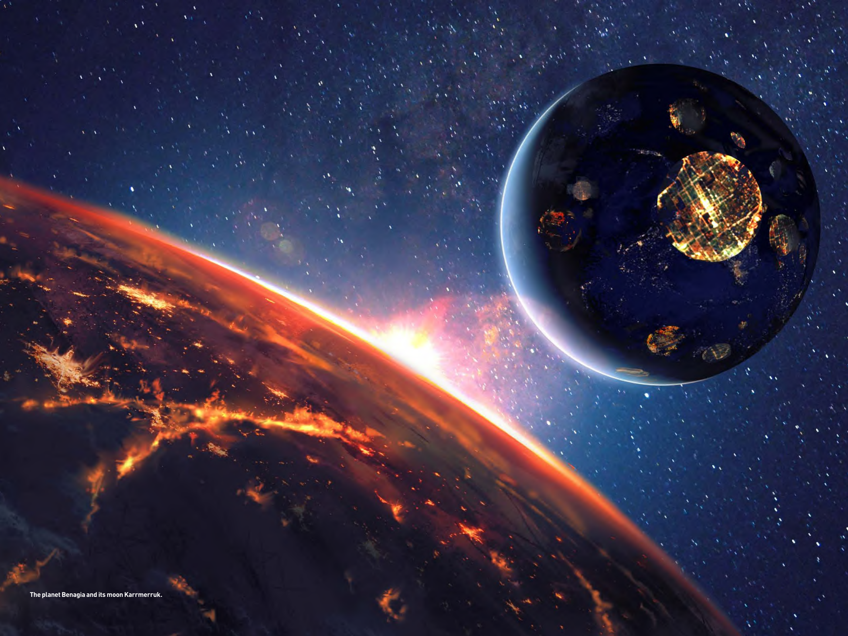
The planet Benagia and its moon Karrmerruk.