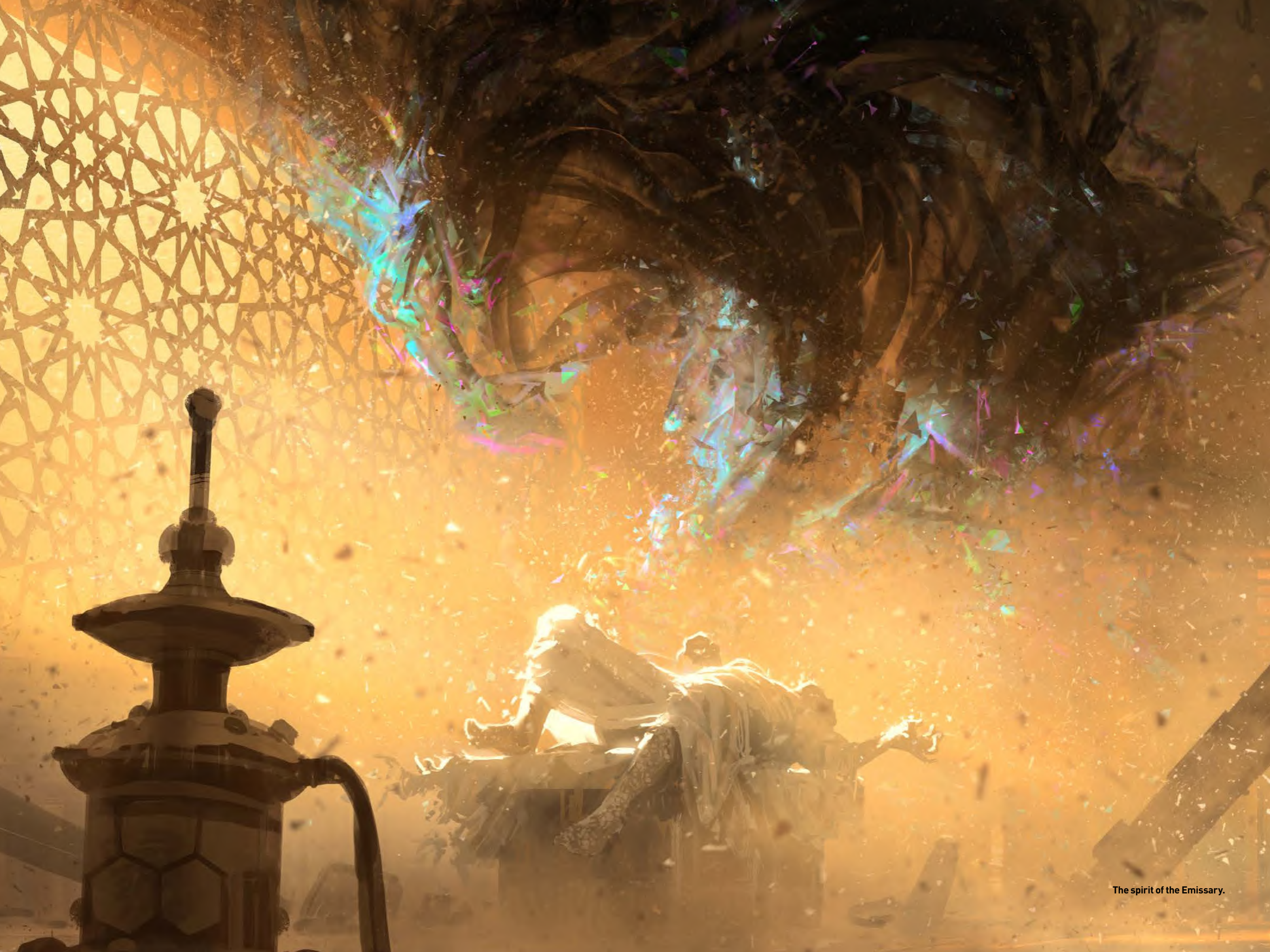
The spirit of the Emissary.