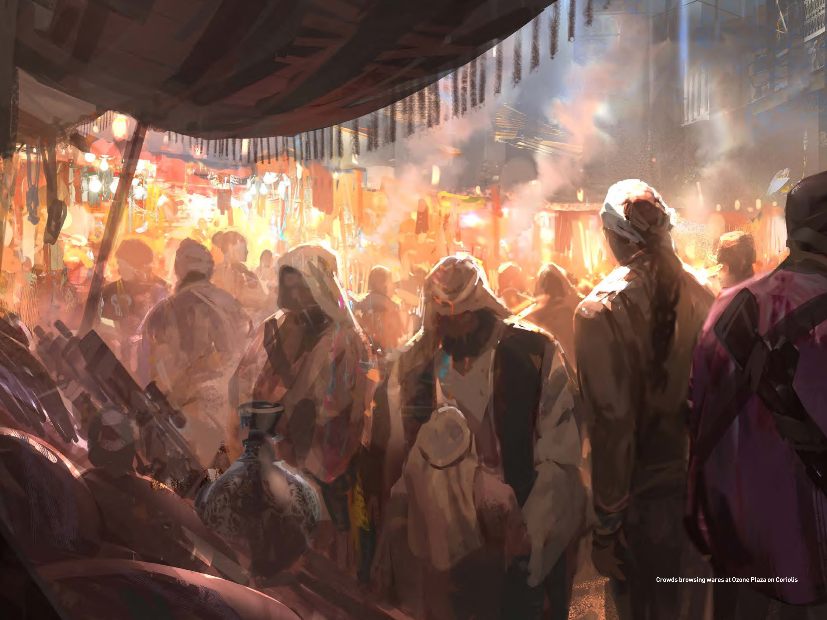
Crowds browsing wares at Ozone Plaza on Coriolis