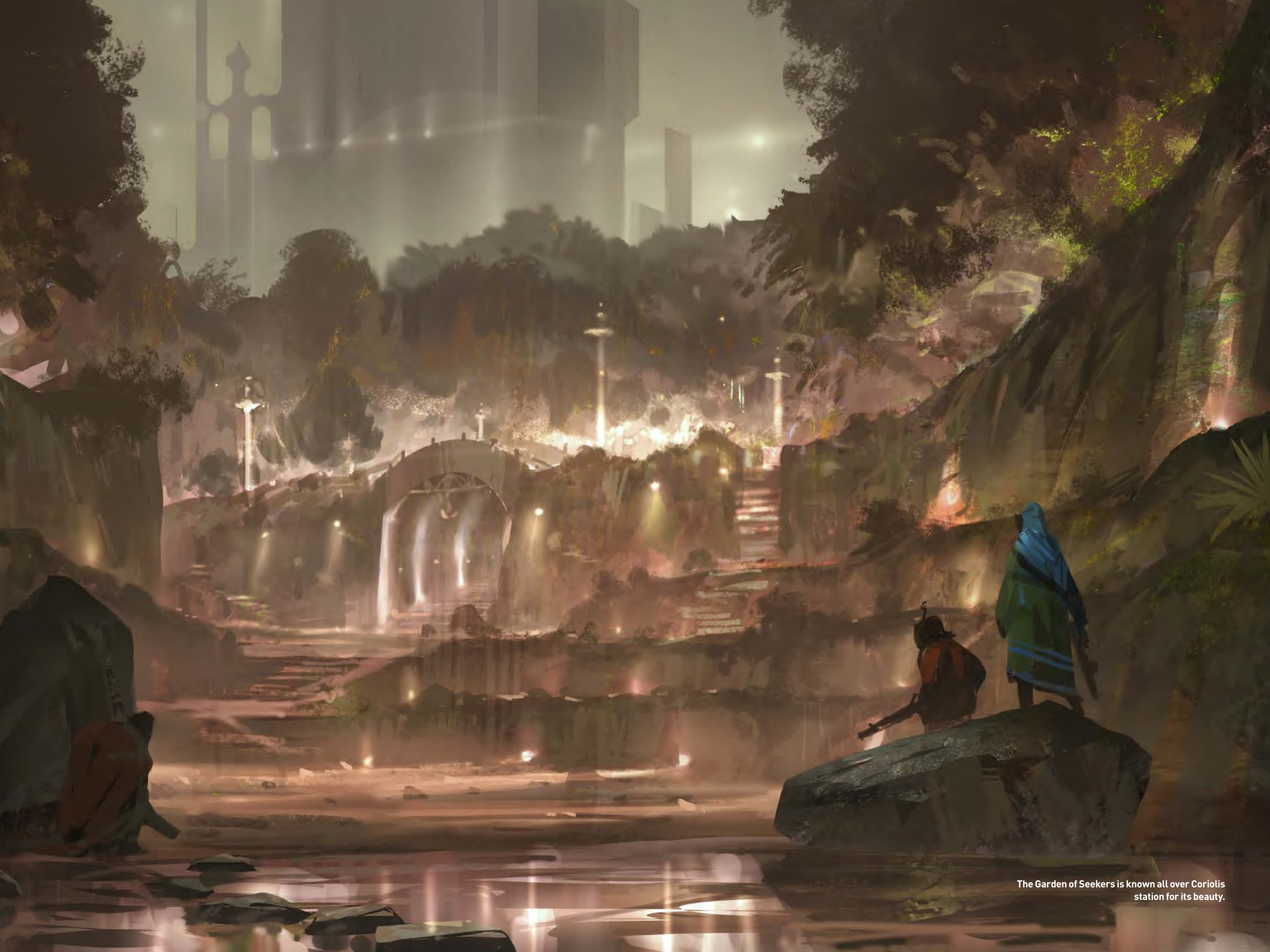
The Garden of Seekers is known all over Coriolis station for its beauty.