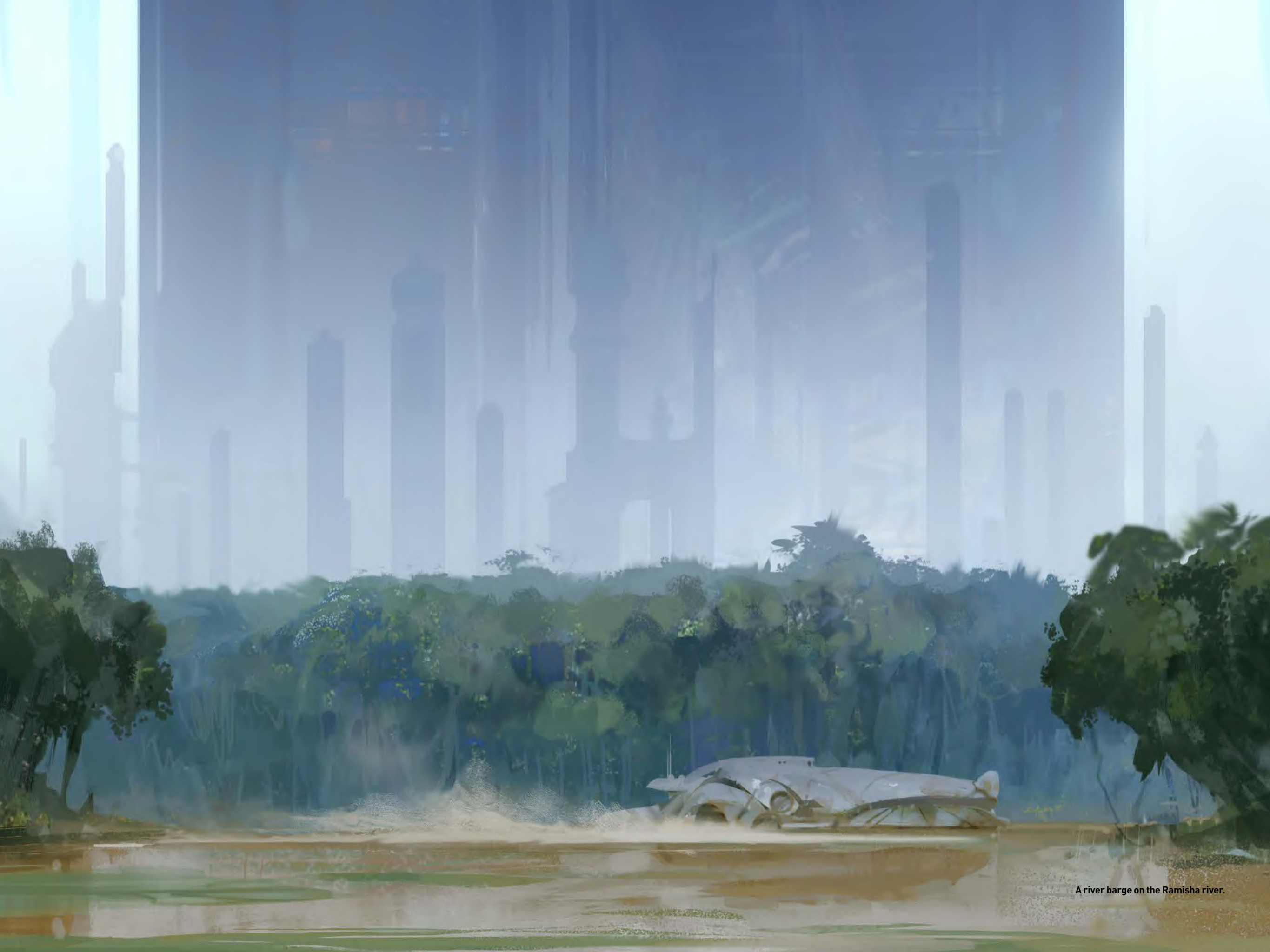
A river barge on the Ramisha river.