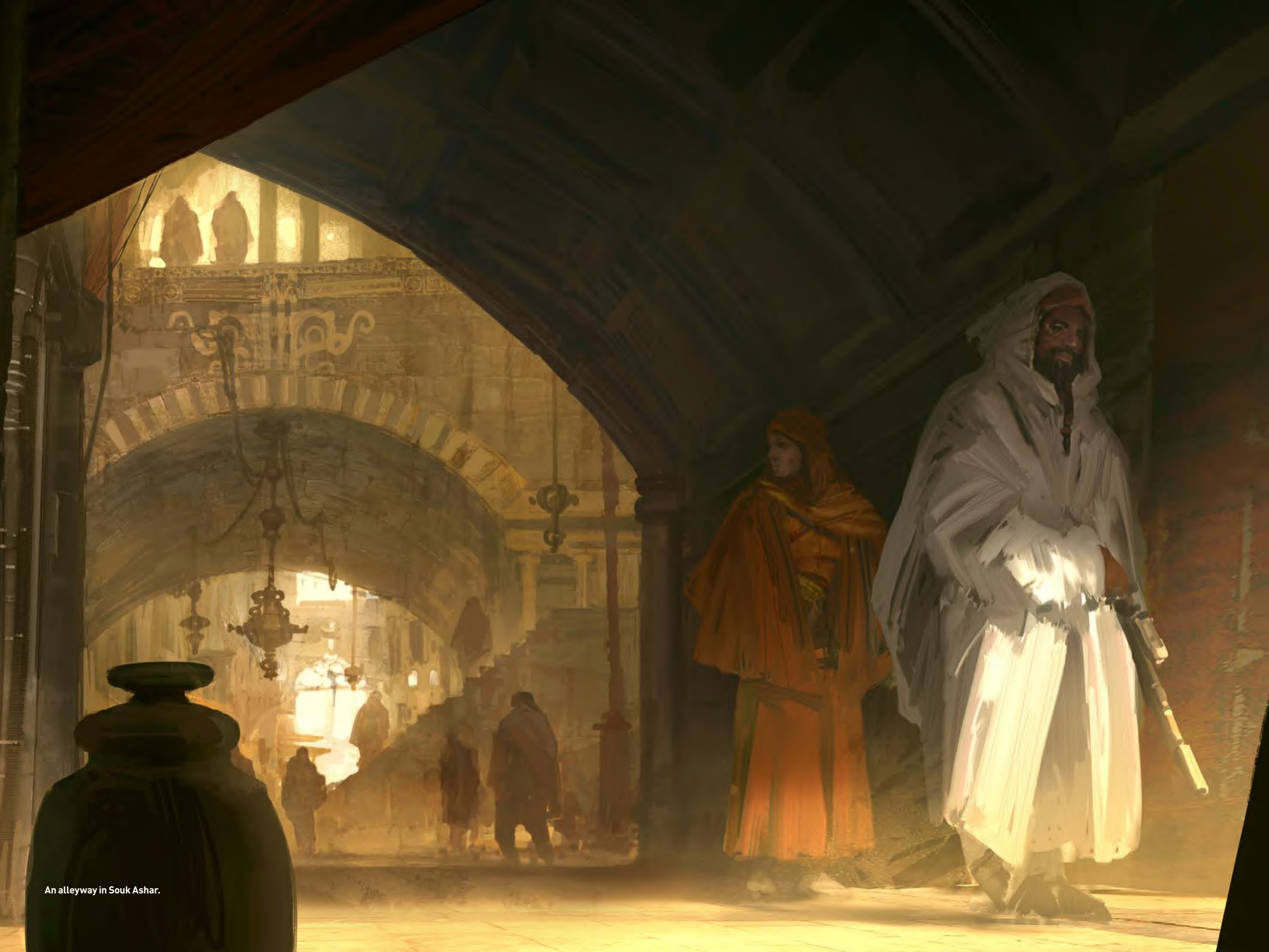
An alleyway in Souk Ashar.