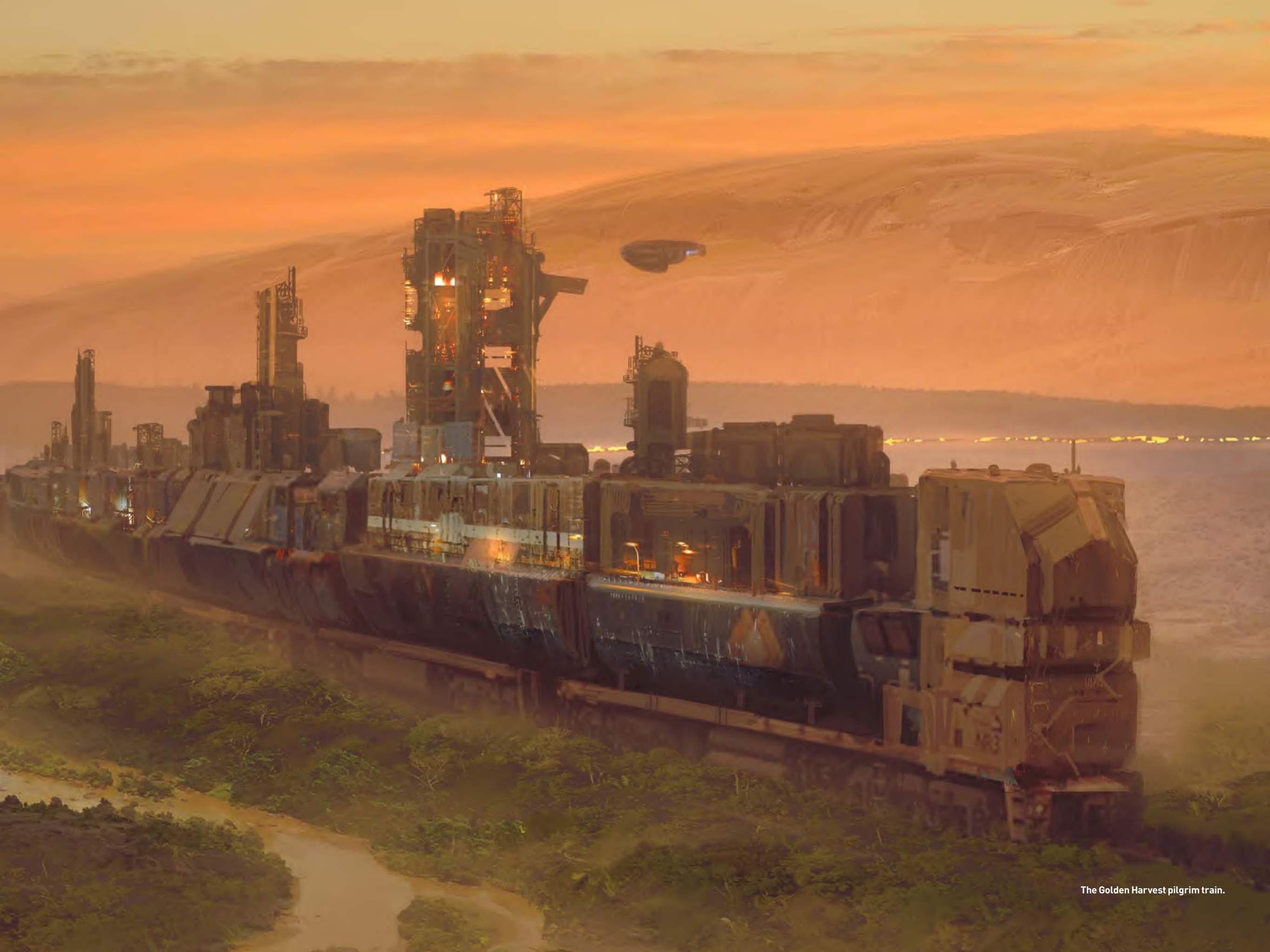
The Golden Harvest pilgrim train.